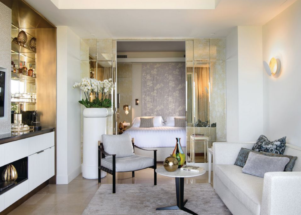
MINIBARS are a feature of most of the suites at Villa Marina, Capri.

can reserve the entire area, and that the signature treatment is the Rituel Nourissant Après-Soleil developed by the French eco-luxury line Cinq Mondes exclusively for Villa Marina. Guests can also use the small covered open-air fitness area.