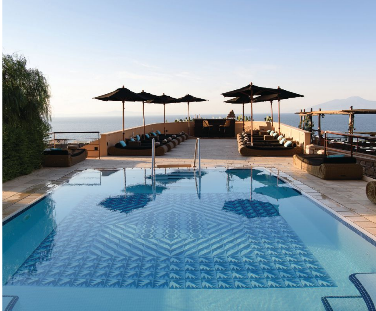
GUESTS can enjoy apéritifs in the Pool Bar, above, or cocktails and long drinks made from a selection of spirits, whisky and liqueurs at the Aria Bar, below.