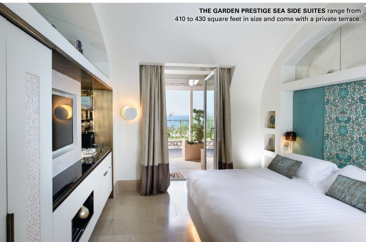
THE GARDEN PRESTIGE SEA SIDE SUITES range from 410 to 430 square feet in size and come with a private terrace.

world's swankiest island. From Pablo Neruda to Gorky, and from the German steel baron Alfred Krupp, whose Via Krupp hairpin footpath down the rocky cliffside is one of the island's showpieces (it is due to reopen this summer after repairs), to the Swedish writer Axel Munth who built the beautiful Villa San Michele — a must-do — in Anacapri which is the island's second largest town.