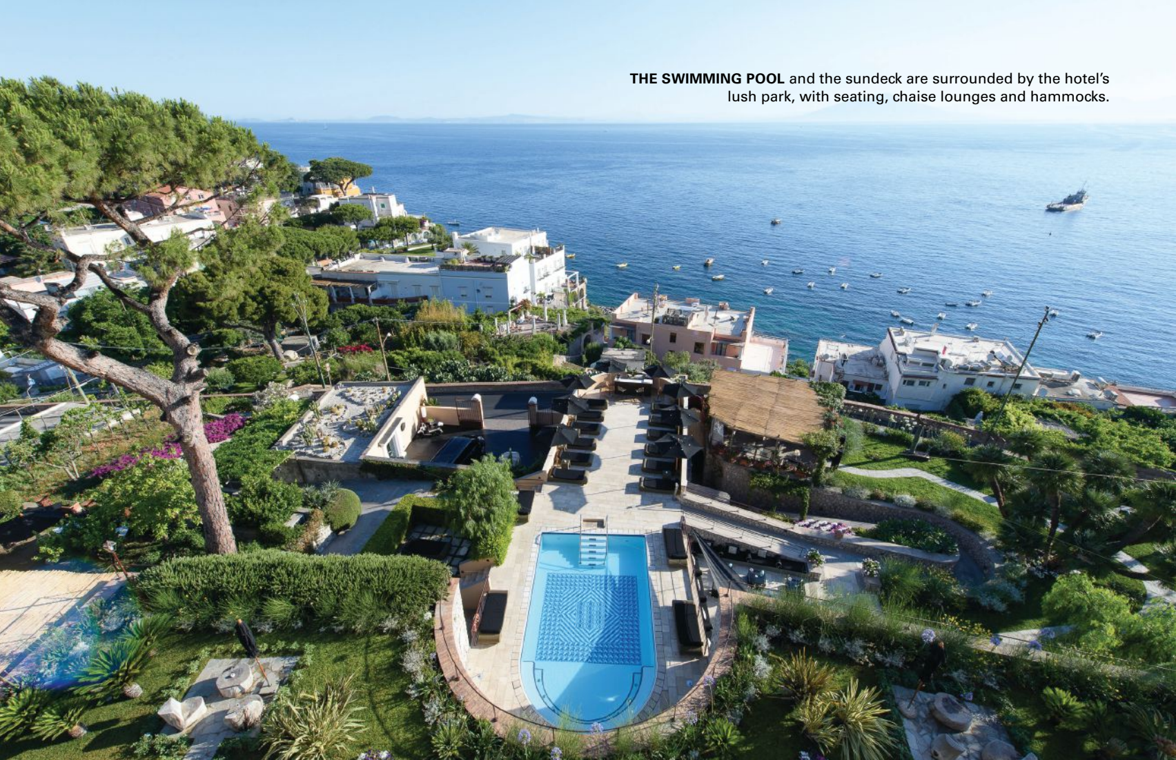
THE SWIMMING POOL and the sundeck are surrounded by the hotel's lush park, with seating, chaise lounges and hammocks.